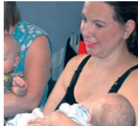
Through support groups, encouragement, and education, more than 64% of WIC mothers in Medina County are choosing to initially breastfeed their newborn babies.