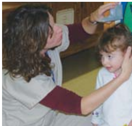
Nurses contracted to work in two public and one parochial school district made over 18,000 student contacts.