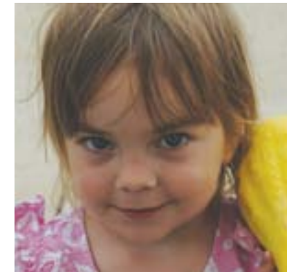
In 2013, redemption of WIC coupons provided Medina County an economic stimulus of nearly 1.2 million dollars.