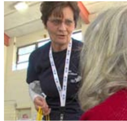
Over 300 Medical Reserve Corps volunteers attended emergency exercises and training throughout 2013.